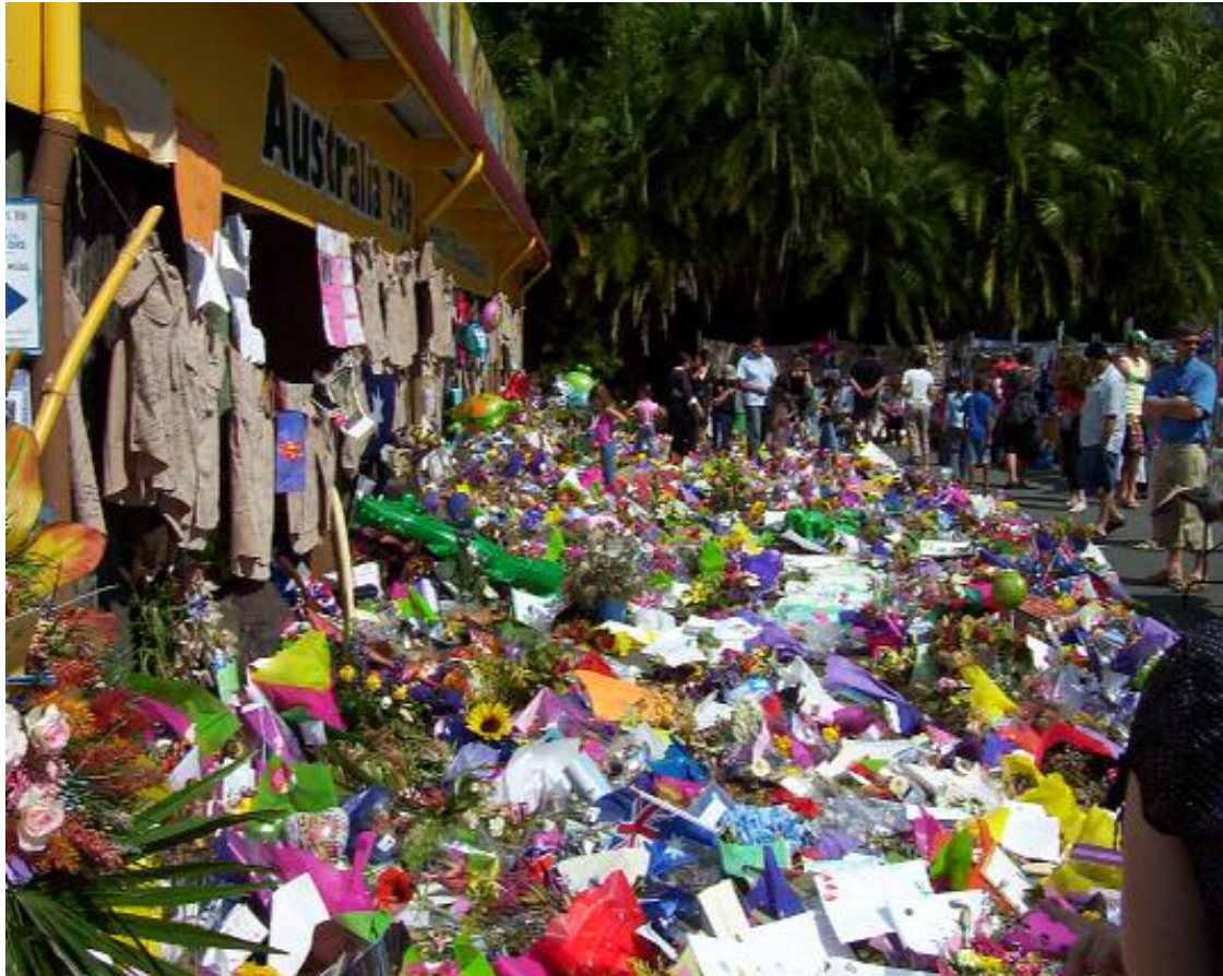
ABOVE: Just part of the memorial set up by fans at Australia Zoo.

Steve Irwin's greatest legacy is his beloved Australia Zoo on the Queensland Sunshine Coast at Beerwah, 74km north of Brisbane. The zoo is in the process of expanding and will be one of Australia's premier zoos. Steve was not just involved with Australia Zoo. He has played a major role in many conservation projects, many of which have remained out of the public eye. The Australia Zoo web site is a wealth of information concerning the work going on at Australia Zoo and on other projects that Steve was involved in, many of which he had financed himself. These projects include various organisations that Steve was involved in and other sites within Australia that Steve has bought and set up for wildlife conservation. For further information on Australia zoo and these other projects visit the web site listed below.