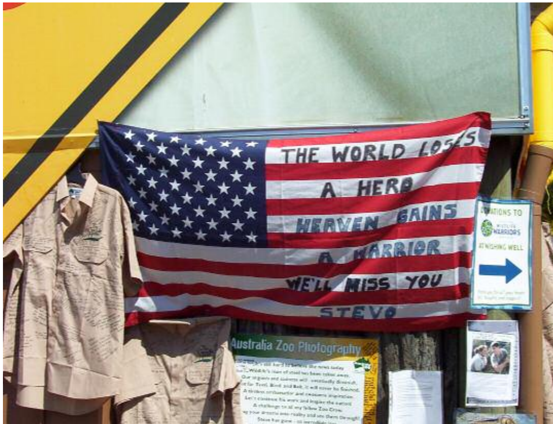
ABOVE: A typical tribute at Australia Zoo to Steve Irwin