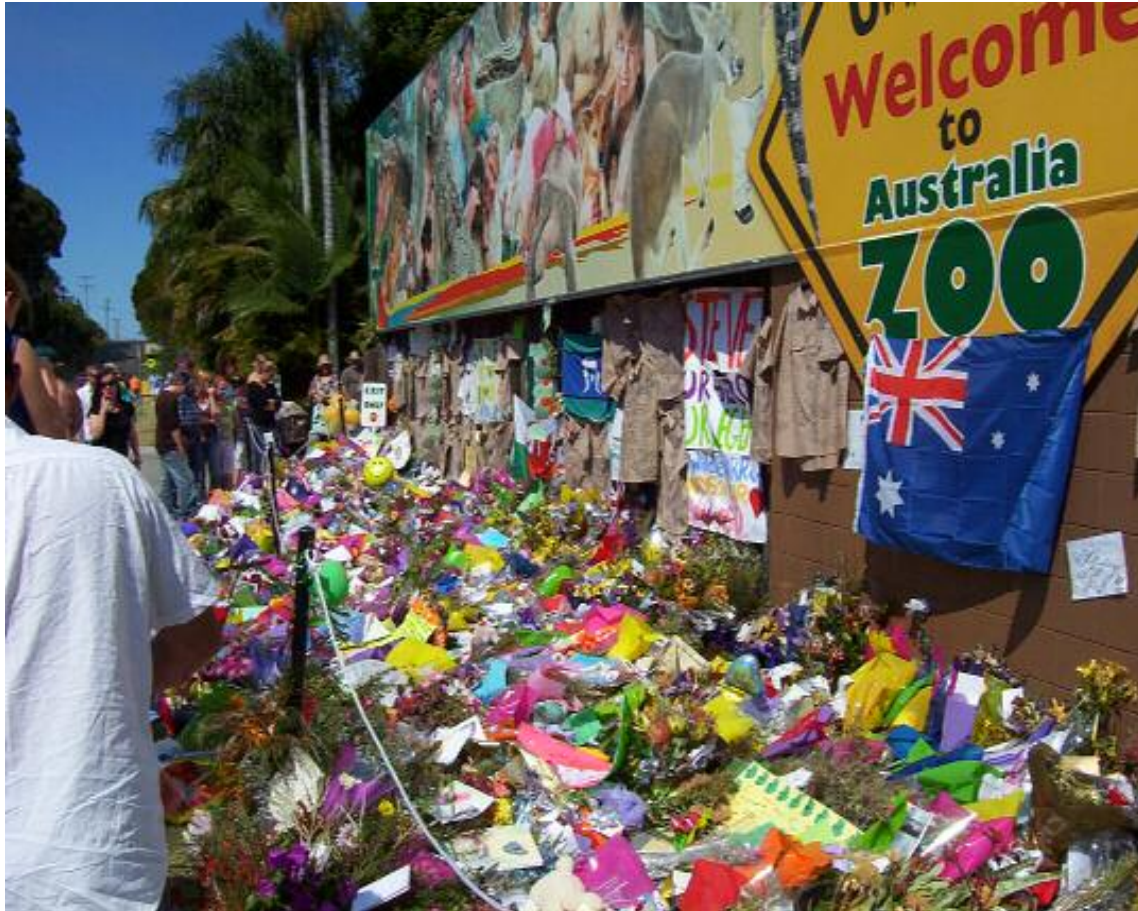
ABOVE: Tributes are arriving on a daily basis at Australia Zoo

The Queensland headquarters for Steve and Terri Irwin is Australia Zoo, just north of Brisbane. Since Steve's death, the zoo has become the international focus for millions of people around the world who have wanted to pass on their thoughts to the Irwin family, Australia zoo staff and to pay tribute to the Australian legend. Khaki shirts with messages penned on them, flowers, balloons, flags and posters, have all been pouring in from fans that live in the area or have to the zoo to do so. Those who have been unable to make the pilgrimage to Australia Zoo have left millions of messages and tributes on message boards all over the world.